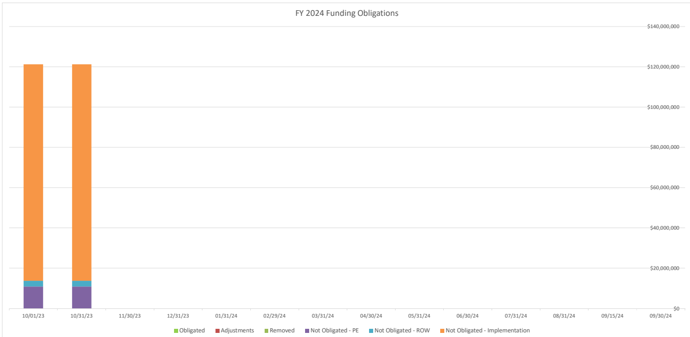
FY 2024 Funding Obligations

If a project is realizing delays that will put the federal funding at risk of forfeiture (i.e., not meet a September 30 deadline), the project sponsor will have the opportunity to request a “one-time extension” of their project schedule. The request for an extension is only available for projects with construction funds programmed in the current fiscal year and is due by June 1, 2024. One-time extensions of up to three (3) months may be granted by East-West Gateway staff and one-time extensions greater than three (3) months, but not more than nine (9) months, will go to the Board of Directors for their consideration and approval. If the project still cannot obligate funds after the one-time extension or the sponsor decides not to proceed, funding will be removed from the TIP, and the federal funds associated with those projects will be returned to the regional funding pool for redistribution without further action by the board.