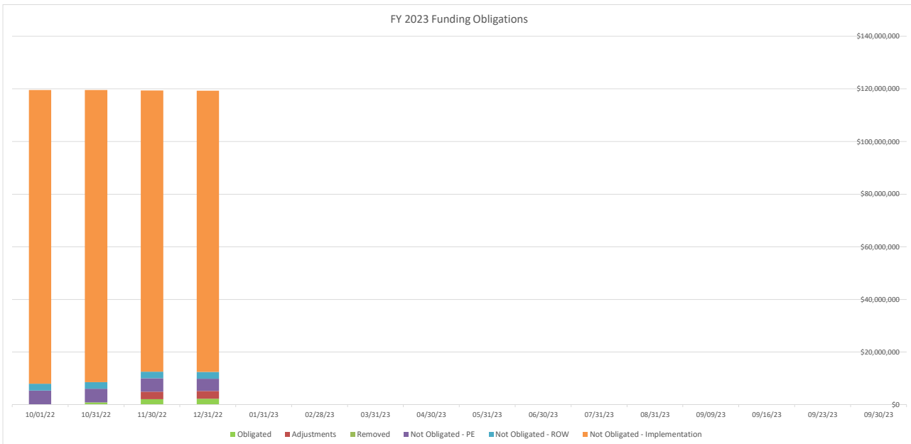
FY 2023 Funding Obligations

If a project is realizing delays that will put the federal funding at risk of forfeiture (i.e., not meet a September 30 deadline), the project sponsor will have the opportunity to request a "one-time extension" of their project schedule. The request for an extension is only available for projects with construction funds programmed in the current fiscal year and is due by June 1, 2023. One-time extensions of up to three (3) months may be granted by East-West Gateway staff and one-time extensions greater than three (3) months, but not more than nine (9) months, will go to the Board of Directors for their consideration and approval. If the project still cannot obligate funds after the one-time extension or the sponsor decides not to proceed, funding will be removed from the TIP, and the federal funds associated with those projects will be returned to the regional funding pool for redistribution without further action by the board.