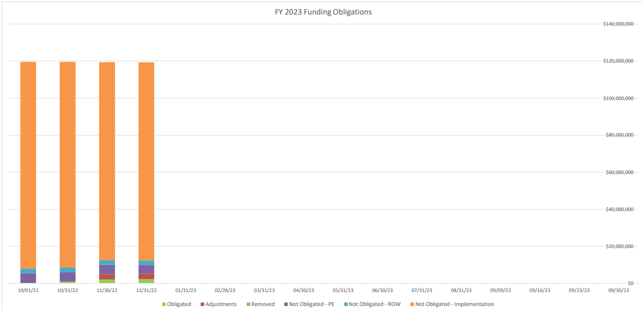
FY 2023 Funding Obligations

If a project is realizing delays that will put the federal funding at risk of forfeiture (i.e., not meet a September 30 deadline), the project sponsor will have the opportunity to request a "one-time extension" of their project schedule. The request for an extension is only available for projects with construction funds programmed in the current fiscal year and is due by June 1, 2023. One-time extensions of up to three (3) months may be granted by East-West Gateway staff and one-time extensions greater than three (3) months, but not more than nine (9) months, will go to the Board of Directors for their consideration and approval. If the project still cannot obligate funds after the one-time extension or the sponsor decides not to proceed, funding will be removed from the TIP, and the federal funds associated with those projects will be returned to the regional funding pool for redistribution without further action by the board.