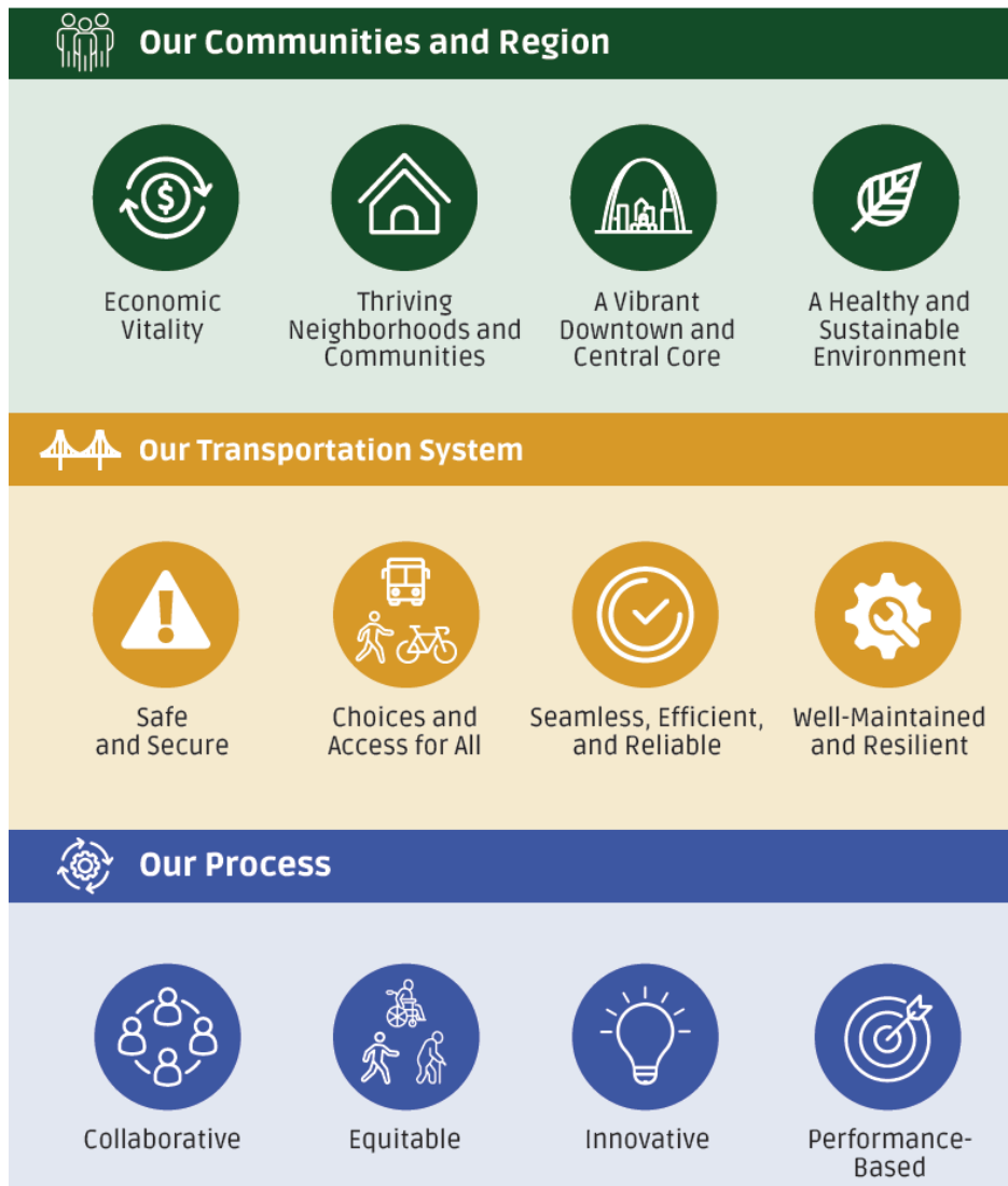
Figure 5: Approved Connected 2050 Guiding Principles

The project team presented the revised Guiding Principles to the EWG Board of Directors and the Equity Advisory Group in September 2022, along with an overview of the Equity Investment Analysis. Based on feedback from the EWG Board, the definition for several Guiding Principles were modified, such as emphasizing the significance of freight to the region. The EWG Board of Directors approved the revised Guiding Principles on October 26, 2022. The approved Guiding Principles and their corresponding definitions are summarized in Figure 5 and Figure 6.