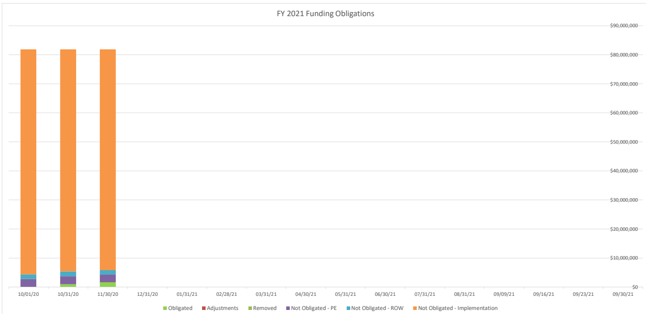
FY 2021 Funding Obligations

If a project is realizing delays that will put the federal funding at risk of forfeiture (i.e., not meet a September 30 deadline), the project sponsor will have the opportunity to request a "one-time extension" of their project schedule. The request for an extension is only available for projects with construction funds programmed in the current fiscal year and is due by June 1, 2021. One-time extensions of up to three (3) months may be granted by East-West Gateway staff and one-time extensions greater than three (3) months, but not more than nine (9) months, will go to the Board of Directors for their consideration and approval. If the project still cannot obligate funds after the one-time extension or the sponsor decides not to proceed, funding will be removed from the TIP, and the federal funds associated with those projects will be returned to the regional funding pool for redistribution without further action by the board.