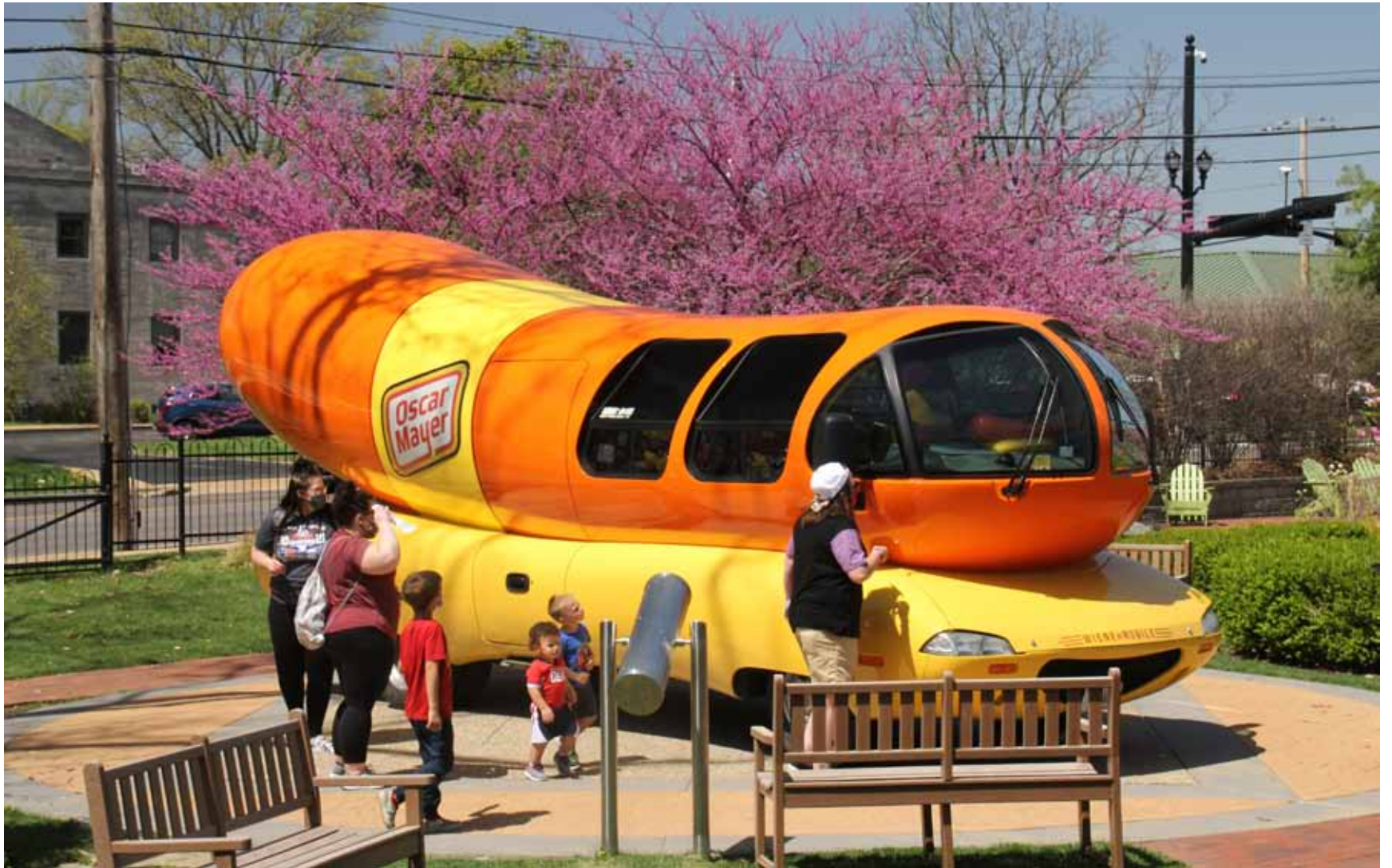
Wienermobile at The Magic House