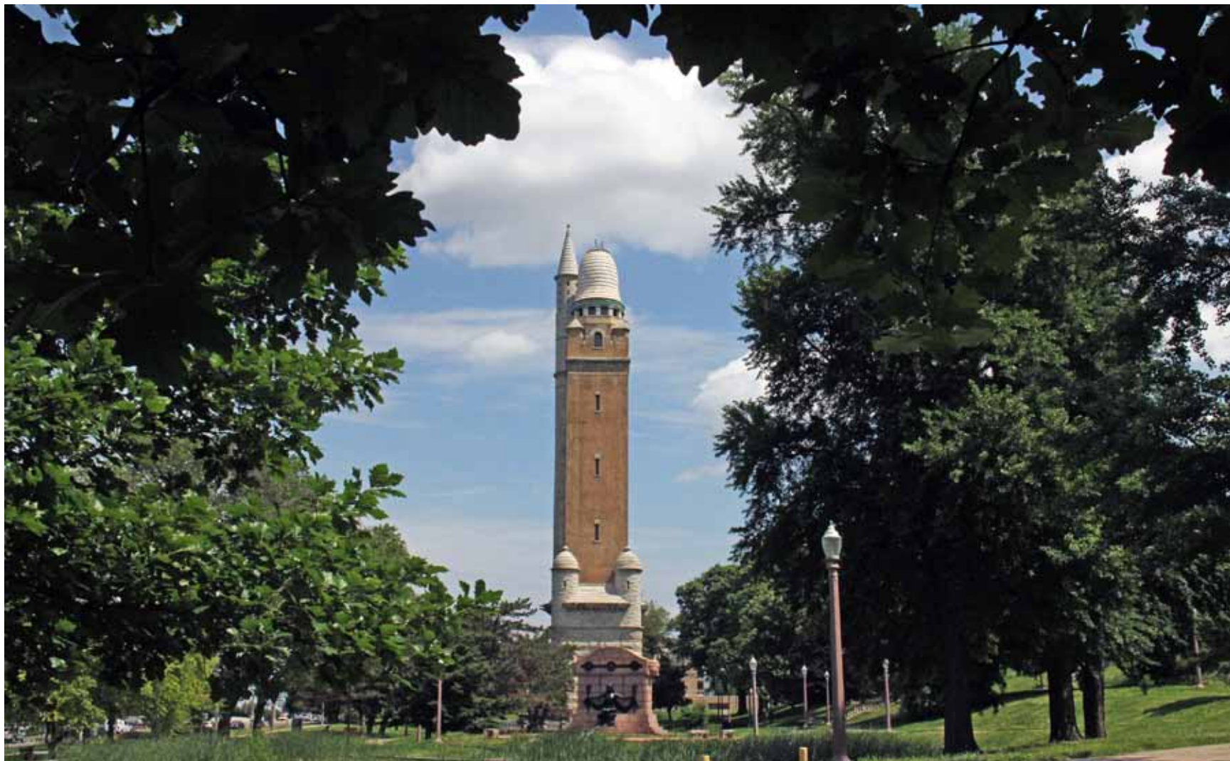
Compton Hill Reservoir Park