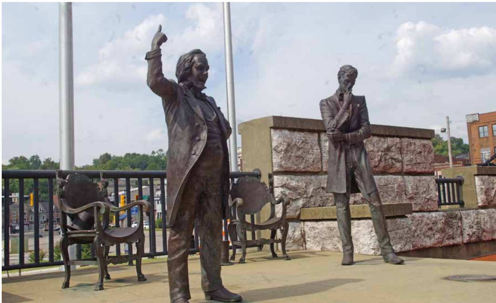
Lincoln - Douglas Debate Alton, Illinois