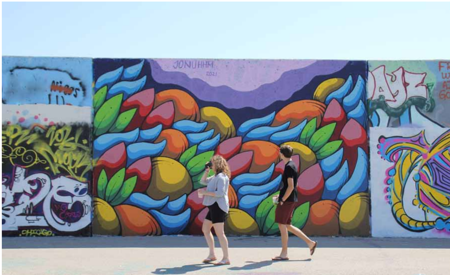
Paint The Wall - St. Louis Riverfront