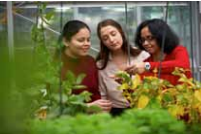
Danforth Plant Science Center

construction of the Brickline Greenway are positioning the region to improve the way it moves goods and people. The OneSTL Biodiversity Working Group works to enhance the resilience of infrastructure by promoting the use of ecological planning tools.