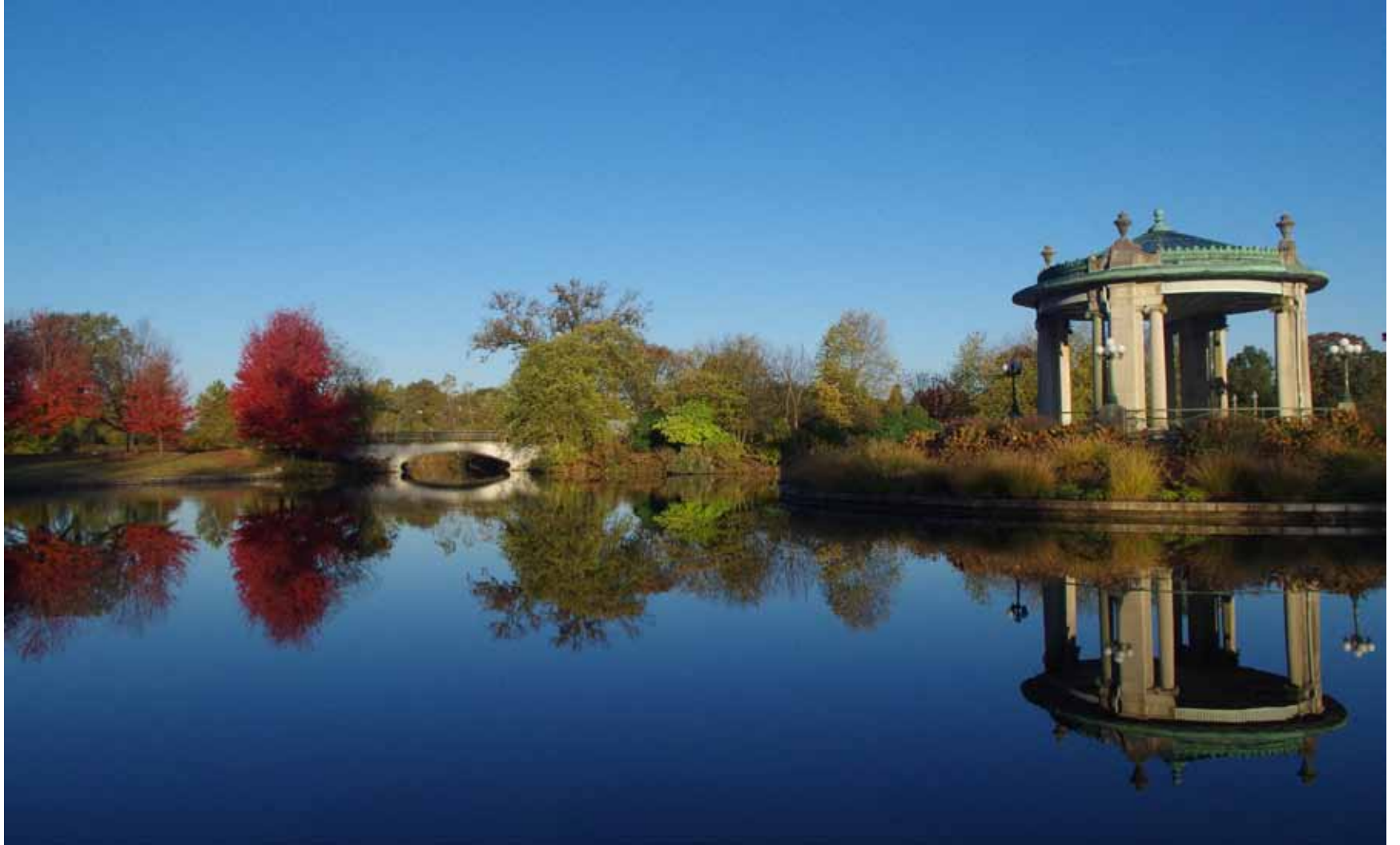
Pagoda Lake - Forest Park