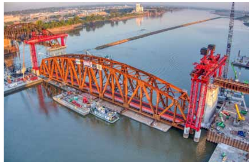
Walsh Construction and Trey Carls Photography