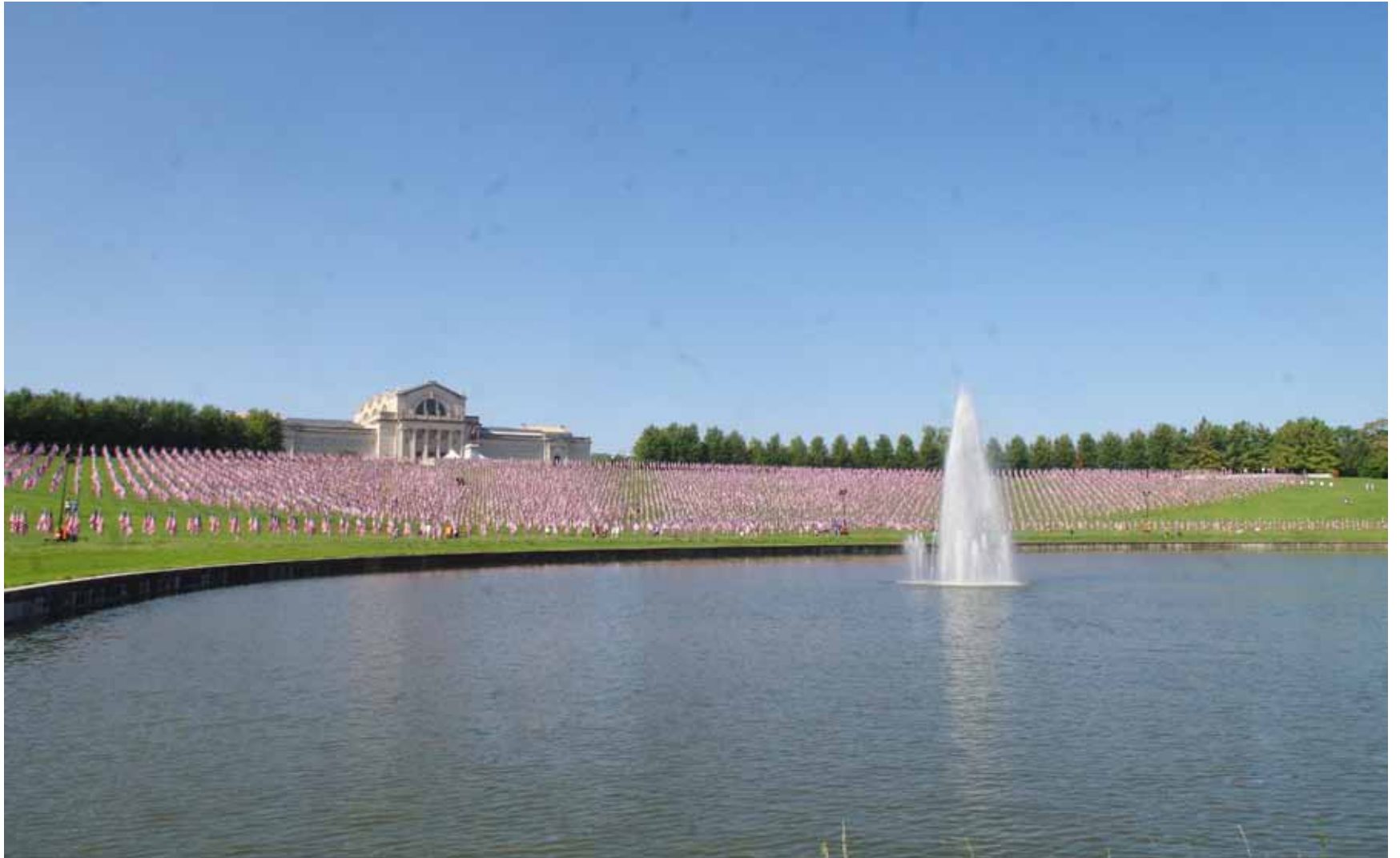
Salute to Veterans