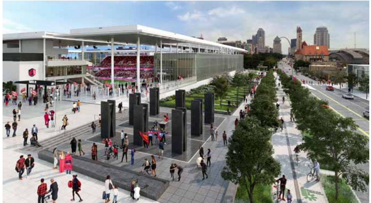
Great Rivers Greenway & St. Louis CITY