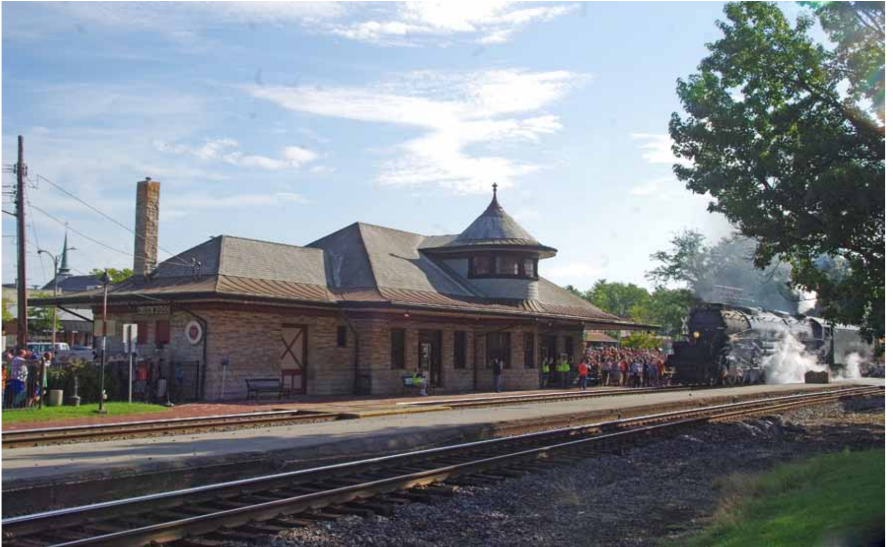
Big Boy at Kirkwood Train Depot