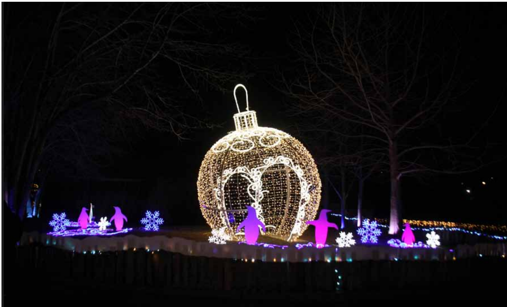
Wild Lights St. Louis Zoo