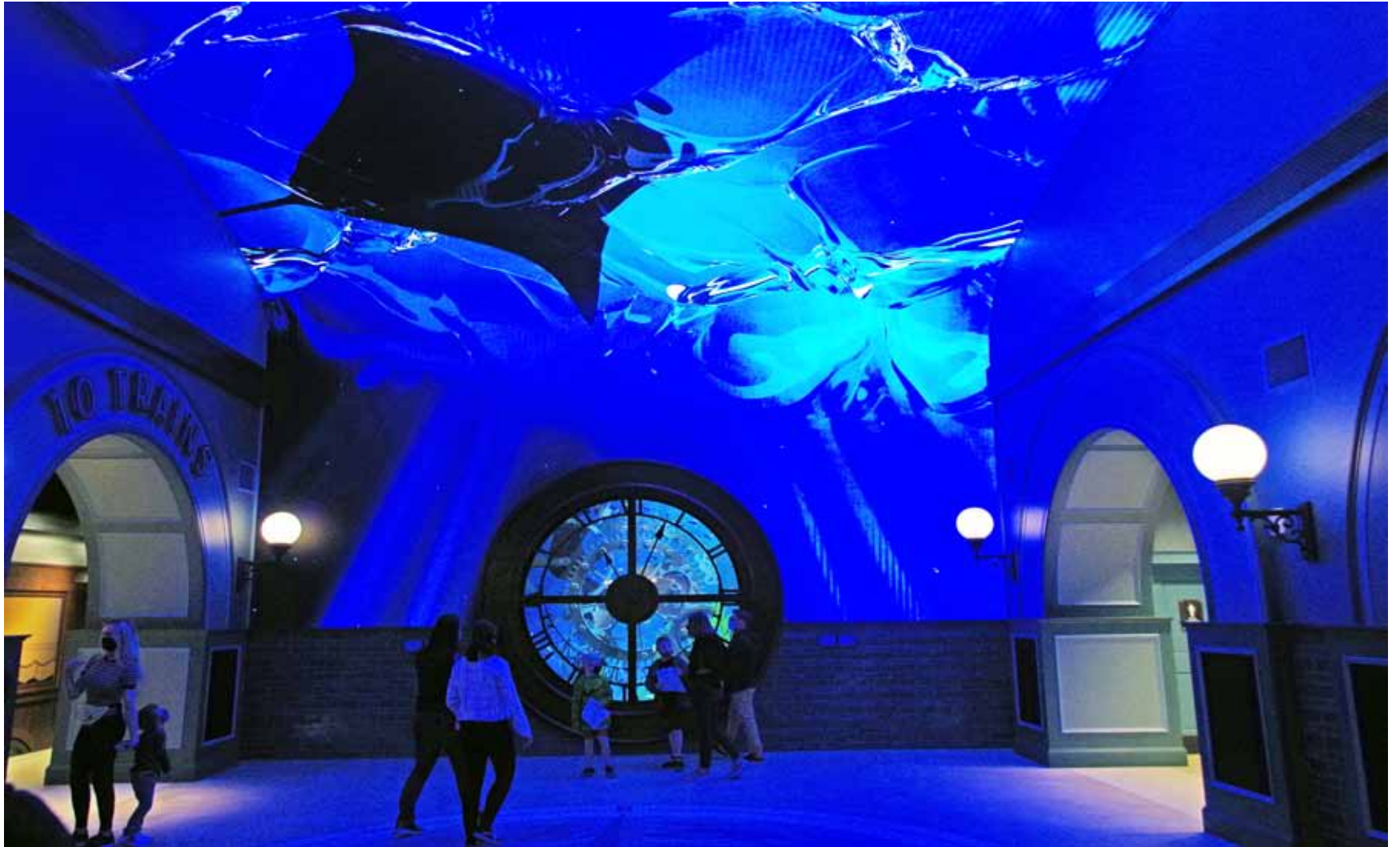
St. Louis Aquarium at Union Station