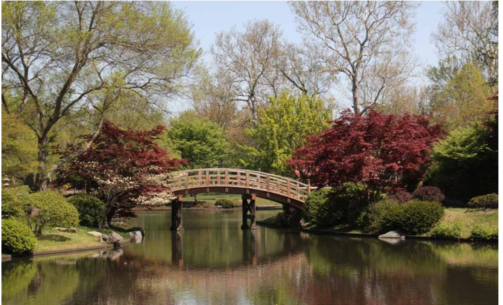
Spring at Missouri Botanical Garden